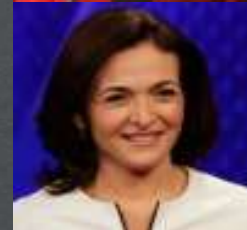
Sheryl Sandberg- COO of Facebook