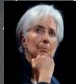
Christine Lagarde- Managing Director of the IMF