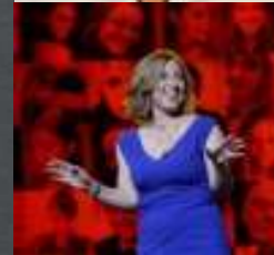
Susan Wojcicki- CEO of YouTube,