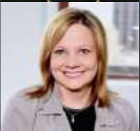
Mary Barra- CEO of GM