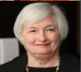
Janet Yellen- Chair, Board of Governors, the Federal Reserve