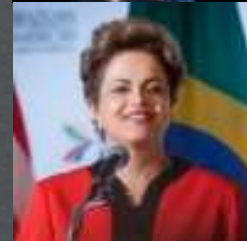
Dilma Rousseff- President of Brazil