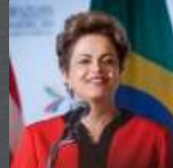
Dilma Rousseff- President of Brazil