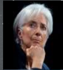
Christine Lagarde- Managing Director of the IMF