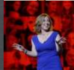
Susan Wojcicki- CEO of YouTube,