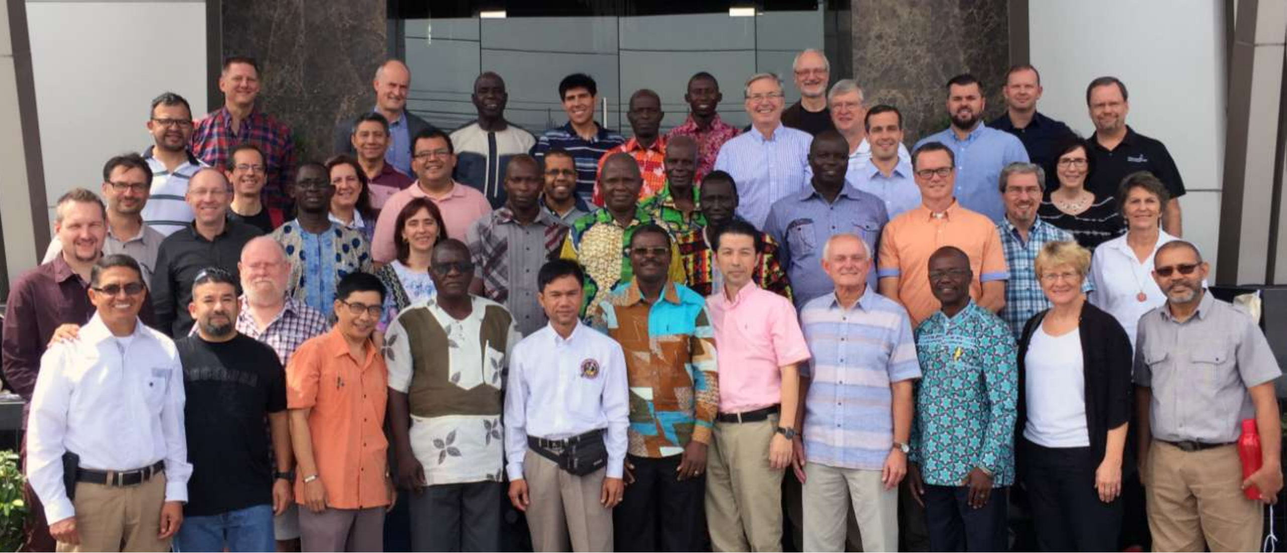
Charis International Leadership Encounter November 2 – 6, 2015 - Bangkok, Thailand